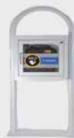
AED Floor Stand Cabinet with Alarm

Surface mount, rolled edges. Works with LIFEPAK 500, LIFEPAK 1000, LIFEPAK CR Plus, or LIFEPAK EXPRESS defibrillators. Steel, with stainless steel trim. Surface mounted trim style with 7" return.