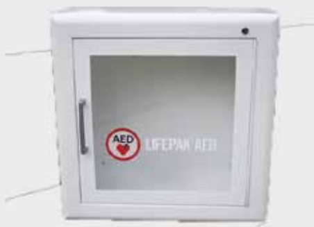
AED Wall Cabinet with Alarm

Wall Mount Bracket for LIFEPAK CR Plus or LIFEPAK EXPRESS AEDs