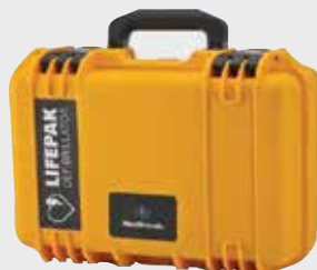
Hard-shell, Water-tight Carrying Case