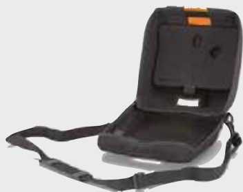
Complete Soft Shell Carrying Case