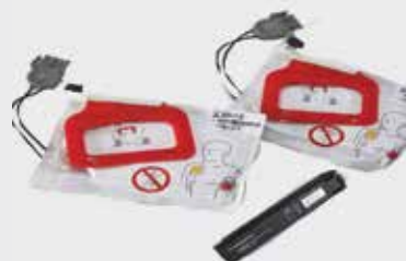
Replacement Kit for CHARGE-PAK™ Battery Charger

Works with LIFEPAK 500, LIFEPAK 1000, LIFEPAK CR Plus, or LIFEPAK EXPRESS defibrillators. White epoxy painted steel 52" tall, 14" x 17-3/8" high x 7" deep