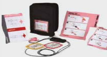
Infant/Child Reduced Energy Defibrillation Electrode Starter Kit

Includes 2 sets electrodes and 1 battery charger, replacement instructions, and discharger for safe disposal of used CHARGE-PAK charger