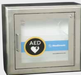
AED Wall Cabinet with Alarm

AED Wall Cabinet with Alarm Surface mount, rolled edges. Works with LIFEPAK 500, LIFEPAK 1000, LIFEPAK CR Plus, or LIFEPAK EXPRESS defibrillators. Steel finish wall cabinet with white trim. Surface mounted trim style with 7" return